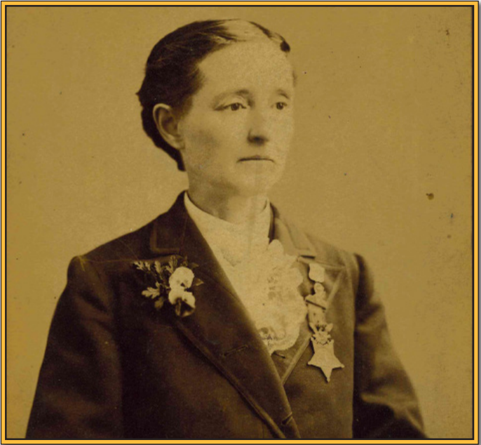
Photo of Dr. Mary Edwards Walker